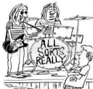
"This way, whenever someone is asked what music they like, we get a free plug."