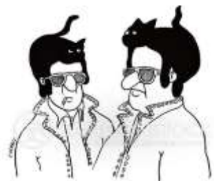
Elvis Presley impersonators