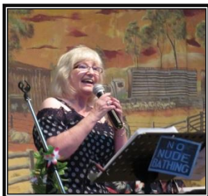
December 2018 Lorraine