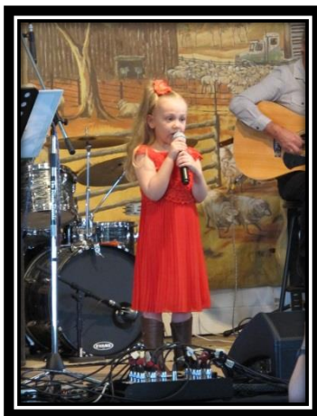
July 2016 April