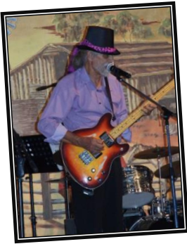
December 2017 JB