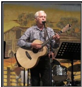
October 2015 Murray