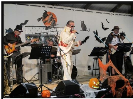
October 2015 Boppa as Elvis