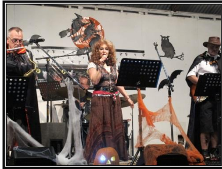
October 2015 Carmel