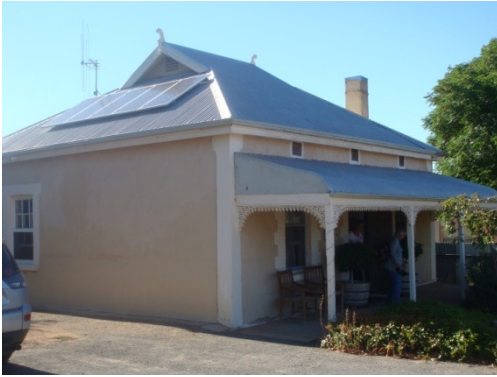
Conningham B&B Gladstone SA