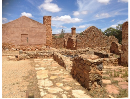
Kanyaka Ruins SA