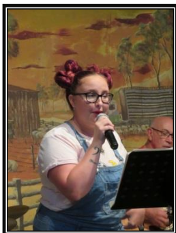
Kaitay December 2019 "I want a Hippopotamus for Christmas"