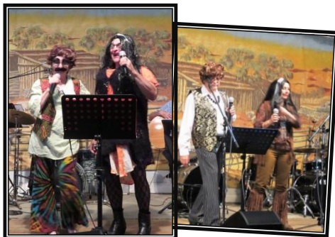
Sonny & Cher Aug 2019 & May 2016 'I Got You Babe'