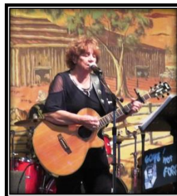
Sandy July 2019 "Walking the Floor Over You"