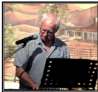
Chas & 'The Wanderer' February 2018