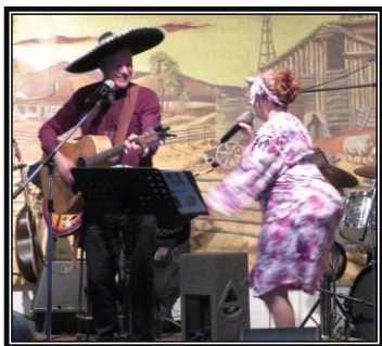
'He drinks Tequila August 2019 She talks dirty in Spanish'