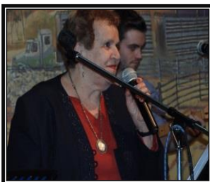
Queenie 'On Sulva Bay' April 2017