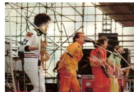
Little River Band

I recall seeing Glenn Shorrock in concert in 2005 long after Little River Band had shone and gone with amazing hits that received world recognition. He was still able to mesmerize the audience with his vocal prowess and shared the stage with the likes of Doug Parkinson and Wendy Matthews also renowned for their solo singing careers. Glenn Shorrock turned 72 this year and I was amazed to find him still performing in Melbourne and producing what can only be described as brilliant vocals. Further, when you analyse the material he has written and still performs; it is not for the faint of heart. These are complex and difficult songs to sing with tricky intonation, complicated chord progressions and with a wide-spanning vocal range. Yet, at the ripe old age of 72, he takes each challenge with ease and a finesse that many a young artist would balk at.